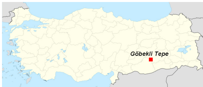
Figure 1. Map of Turkey, showing the location of Göbekli Tepe. This is about 50 km north of Abraham's city of Haran, today modern Harran, in Şanlıurfa Province. (Work by Bjoertvedt 2008, Wikipedia .)

We will start with a data point on the conventional timeline that represents very early humans. On a biblical timeline, this data point is the date of the earliest tools that would have been used by early post-Flood humans. In the evolutionary view, stone tools evolved from very primitive to more advanced; any given tools are therefore dated according to an assessment of how "advanced" they are. We must therefore proceed cautiously because some of the objects that they claim are very early tools look like nothing but broken stones; what complicates their thesis is that there are animals like chimpanzees that make and use tools (e.g. stones and twigs) even today. But the most telling information on this subject is that there is a sudden leap in sophistication of stone tools with the Acheulean ones (named after Saint-Acheul in France). These Acheulean hand-