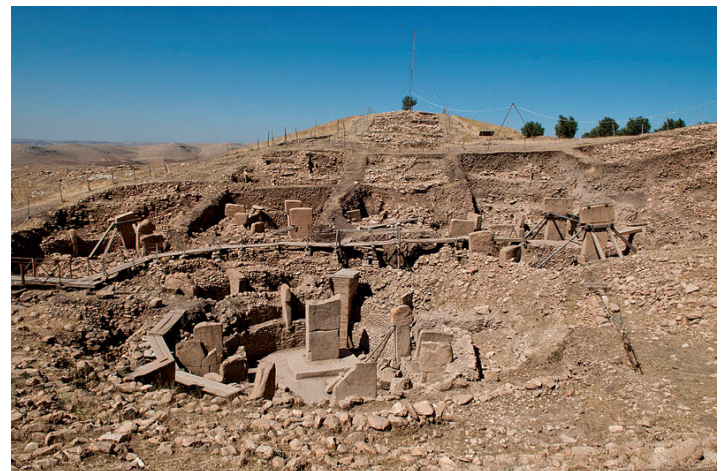
Figure 2. View of the Göbekli Tepe site before the first (temporary) cover was built for protection against the elements. A permanent roof is now being built.

As noted earlier, the earliest level of Göbekli Tepe dates to just under 10,000 BC (CT). This date is significant because 10,000 BC(CT) was approximately the end of the great Ice Age, and the beginning of the Holocene era (Walker et al. 2009). Therefore, the data point of 10,000 BC(CT) has a double meaning: it will go on the conventional timeline for both the founding of Göbekli Tepe and the end of the deglaciation in both figures. If we knew exactly when the Ice Age ended in the Old Testament, we would have an easy answer to the question of the biblical dating of Göbekli Tepe. But Scripture is silent on the end of the Ice Age. Therefore, the