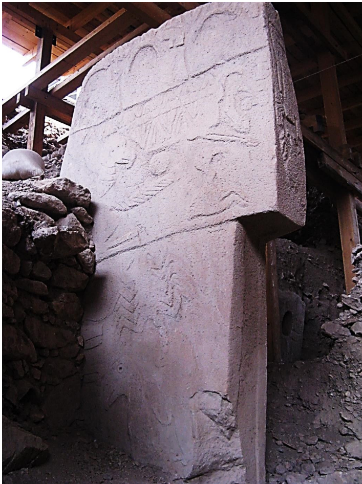
Figure 5. Close-up of carving on large T-stone. The temporary roof is seen in the background.

In this attempt at placing Göbekli Tepe on the biblical MT and LXX timelines, we see that ancient places and events are crowded close together far more recently in historical time than we are led to believe by conventional historians. Because of its claimed age, Göbekli Tepe therefore appears to be a lot older to conventional archaeologists than it actually is. It is proposed that the Göbekli Tepe site was most likely founded somewhat more than 100 years before Abraham's visit to Egypt (Masoretic timeline) or, alternatively, about 250 years before Abraham's visit to Egypt