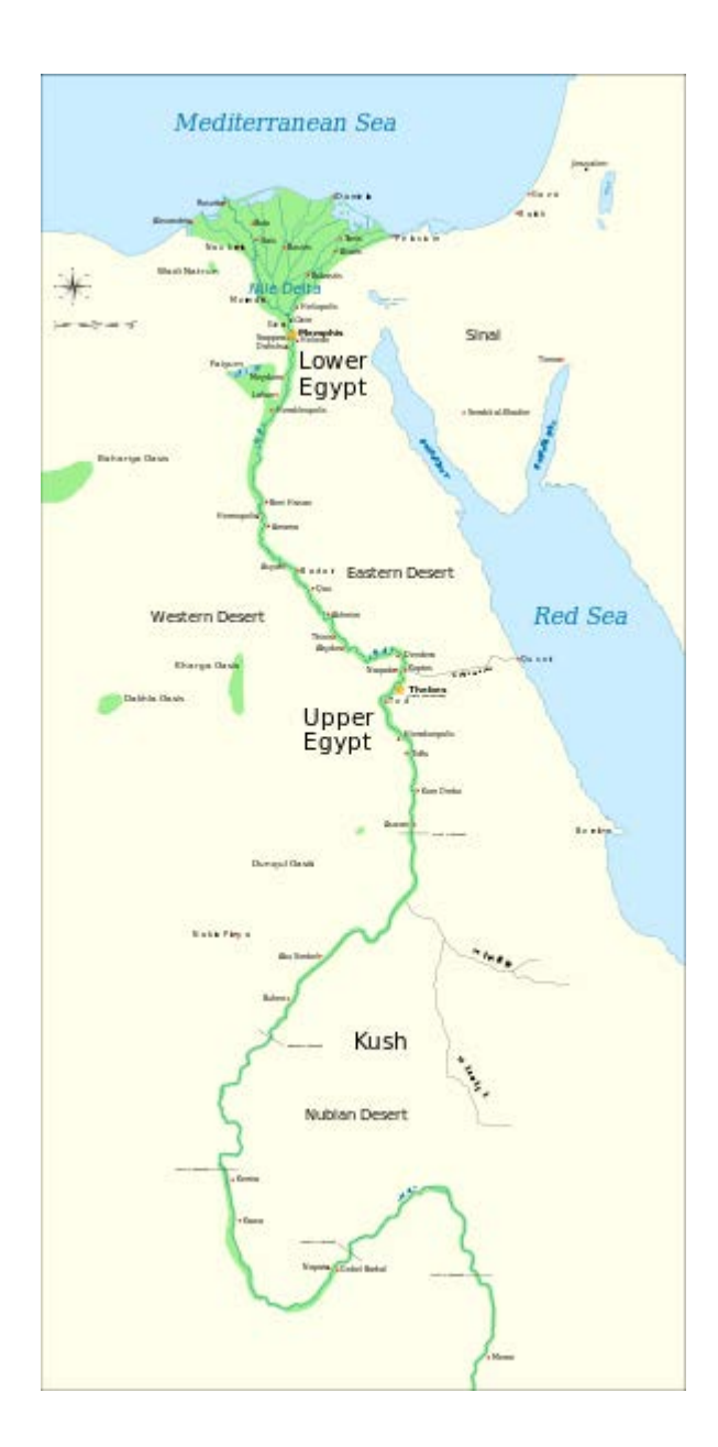
Figure 1 . Map of ancient Egypt at the beginning of the Dynastic period. (Jeff Dahl, 2007, Wikipedia .)

the desert lands on each side of the Nile, and further east, beyond the Gulf of Suez, the Sinai peninsula.