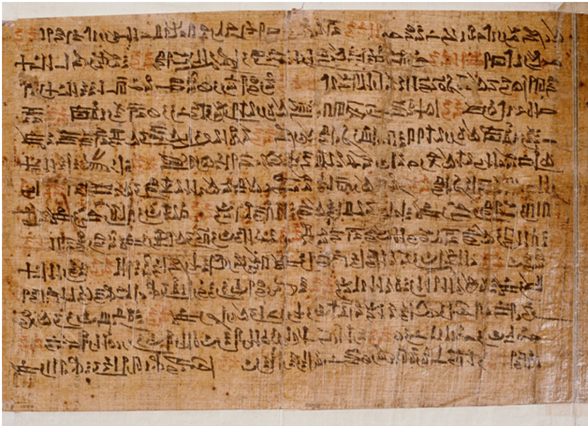
Figure 1. Photo of a section of the Ipuwer papyrus that is located in the Dutch National Museum of Antiquities in Leiden, Netherlands. (Public Domain)

There is one other factor to be considered. The pharaohs of Egypt had absolute power, and were ruthless in exercising it. Would Ipuwer have dared to say such things to the pharaoh as are written in this manuscript? This seems unlikely, because the pharaoh could